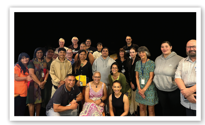
Kia ora - E te iwi ki Domain Lodge. Whanau, Hauora providers and Programme Facilitators pictured.